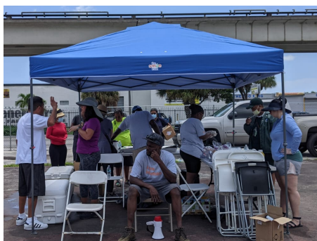
SMILE Trust and POWER U community hurricane preparedness event.

hurricane preparedness kits and gratitude for the support and solidarity from POWER U .